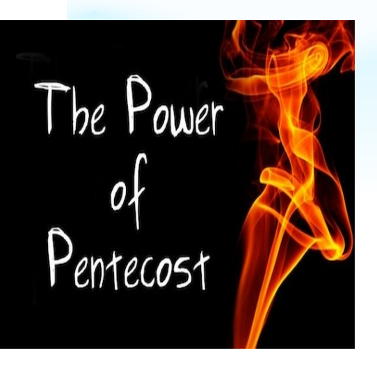
Ruach HaKodesh or Holy Spirit

It is the second of the three Pilgrim festivals and it happens in Israel on the 6th of Sivan, (Hebrew Roots/Jewish Calendar) this year on May 24th and everywhere but Israel for two days 24th and 25th. It has other names in Hebrew such as Hag Ha-Katzir meaning Harvest Festival. It was when the ingathering of barley crop ended and the season of wheat harvest began. But Yom Ha-Bikkurim (Day of First Fruits or Shavuot in the Jewish World, and Pentecost in the Christian World)