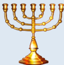
Seven lamp traditional Menorah

dedication. It commemorates the rededica-